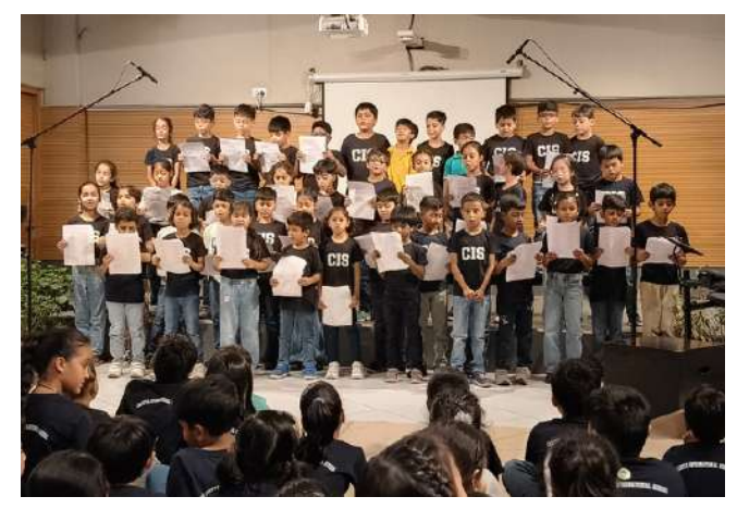
Grades 1A & 1B

Grade 1A sang "Waving Flag", while Grade 1B performed "Let It Be". They then came together to sing "My Favourite Things". Grade 2A delighted the audience with "Animals" and "Waving Flag", and Grade 2B followed with spirited renditions of "When I Grow Up" and "Believer". Grade 3A performed "Die With a Smile", while Grade 3B sang "Everybody Wants to Rule the World". The assembly concluded with both Grade 3 sections singing a lively fruit-themed song in Spanish and French, reflecting their learnings from the Foreign Languages they had started learning this session.