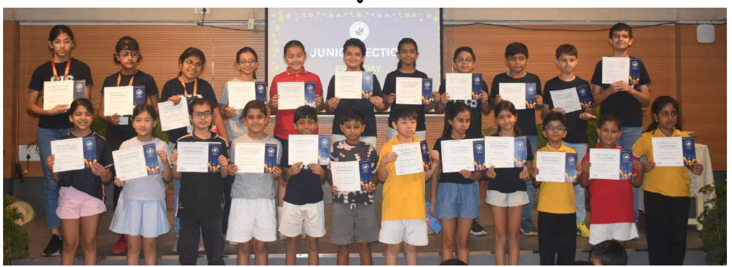
Each year the Junior School Choir mesmerizes us with their spectacular performances. This year was no different and hence the choir members were acknowledged with certificates.