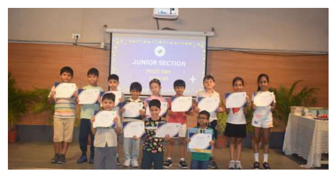
Grades 1A & 1B