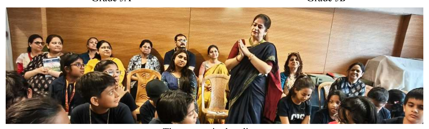
The mesmerised audience