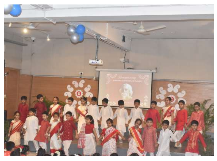
CIS HERALD | April - May Edition | Page 42