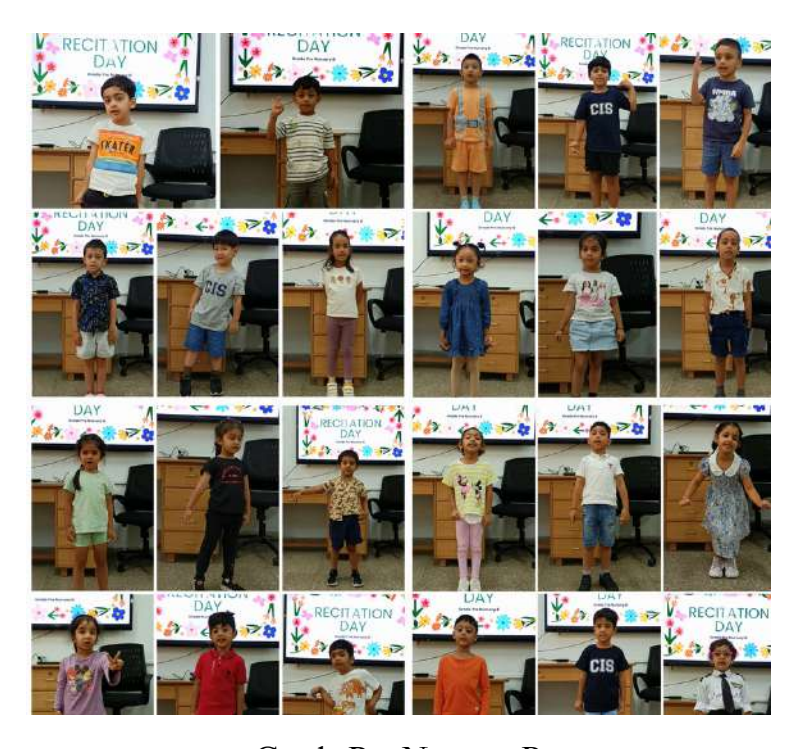
Grade Pre Nursery B