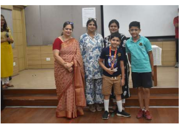
Robotics (Overall Learning, Understanding & Presentation):