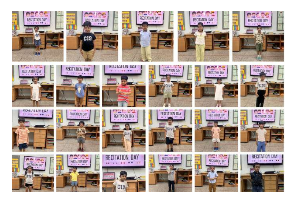
Grade Pre Nursery A

The activity not only helped in improving their vocabulary, pronunciation and memory but also encouraged stage presence and the ability to speak in front of an audience. Teachers and peers enthusiastically applauded every performance, creating a warm and encouraging environment.