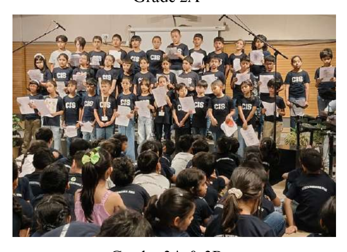
Grades 3A & 3B