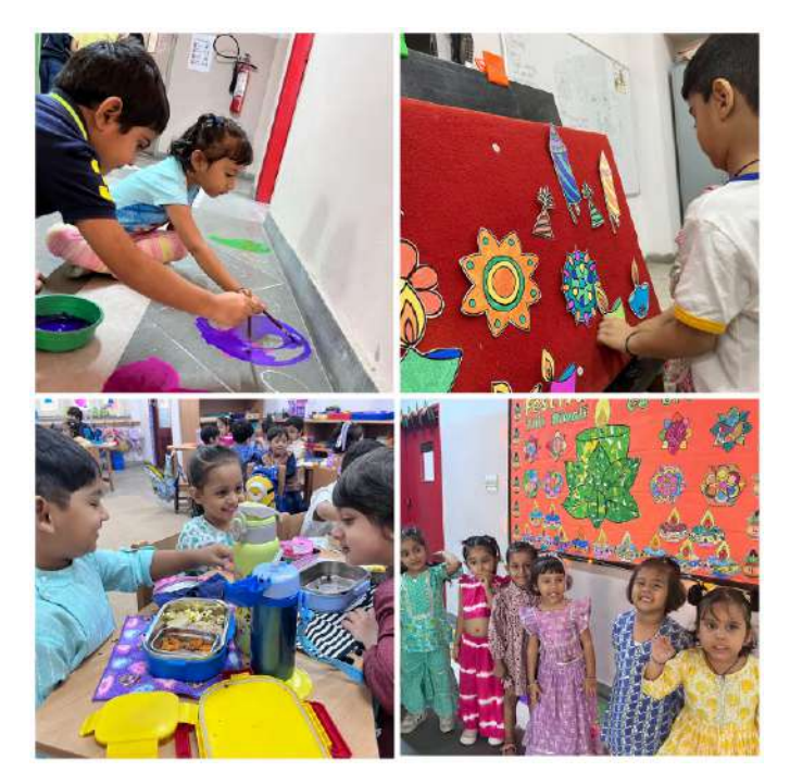
Pre Nursery A

The students of the Primary Section celebrated the festival of lights enthusiastically with their peers and teachers. They were all beautifully dressed up in ethnic wears.