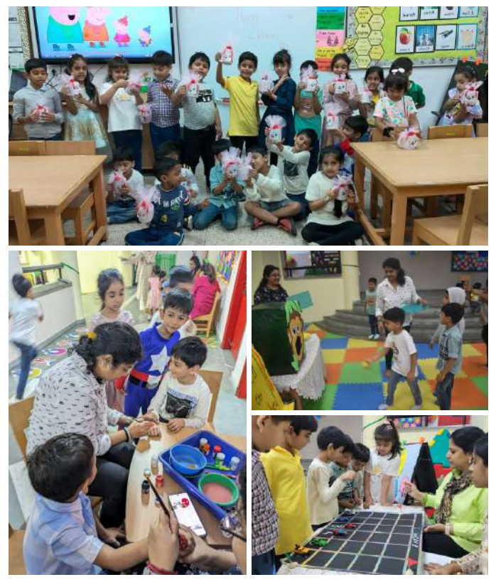
Upper Nursery A

As a loving gesture, each student received specially designed mugs adorned with their favourite characters and a quote- Glitter, Sparkle, Twinkle and Shine.