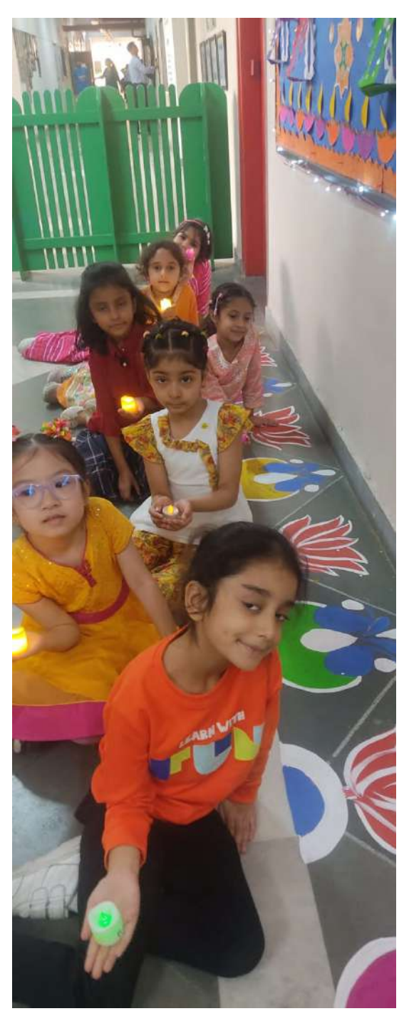
Upper Nursery B

Students enjoyed making various crafts based on Diwali, painting rangolis with vibrant colours and making cards for their parents and their loved ones.