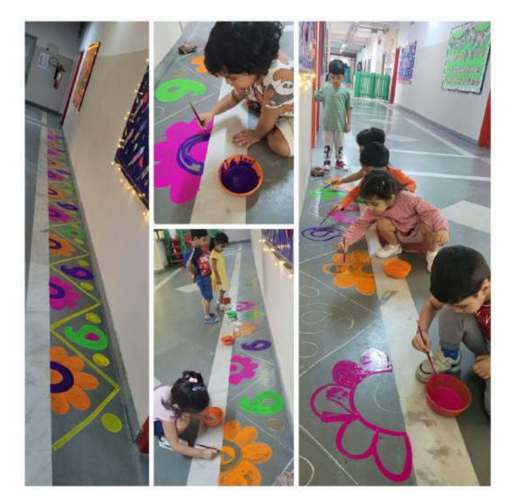
Pre Nursery B