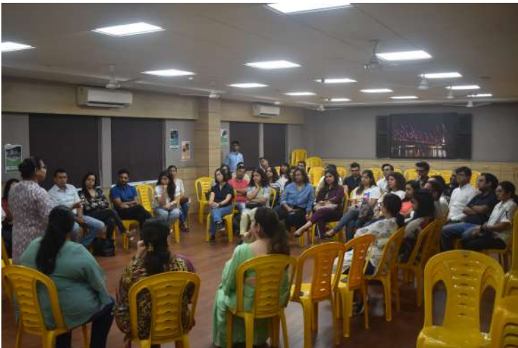
Counselling Session with parents of Grade 3

Parents were enlightened on the 'Transitions During Puberty' sessions with students of Grades 3-5, and some of their critical responses/queries on bodily changes, menstruation, reproduction/intercourse, gender and sexual orientations. The interactive sessions emphasized the need for parents to initiate conversations with their children on these topics so as to create a safe space for knowledge sharing that is authentic and age appropriate. It was also highlighted that open conversation normalizes talking about such topics which are usually deemed as 'taboo' by the society. Over time, it builds trust and enables a child to express themselves better and reach out for support if they are feeling awkward or confused, as these are common emotions accompanying pubertal changes. Parents were guided on how to initiate discussions about puberty, age appropriately and to reach out to the counsellors in case they require any support.