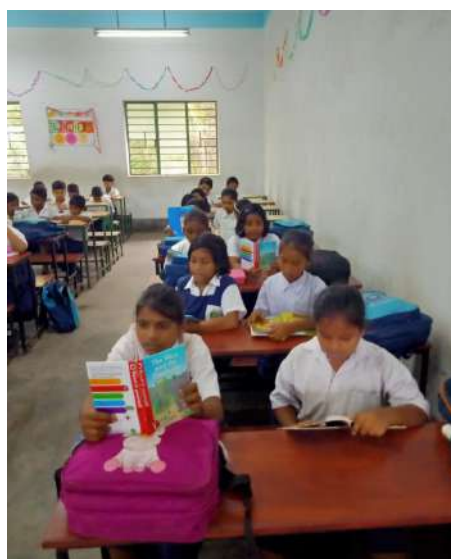
Students using the books