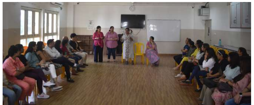
Counselling Session with parents of Grade 5