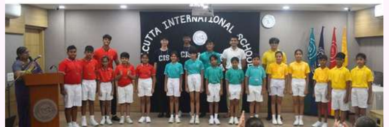
The Junior School Students Council Members with the Senior School Captains