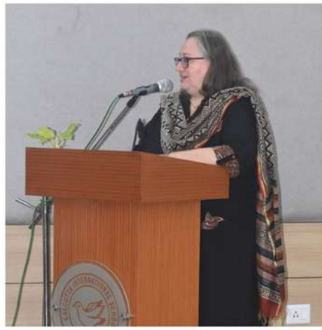
The lighting of the lamp and the address by the Principals