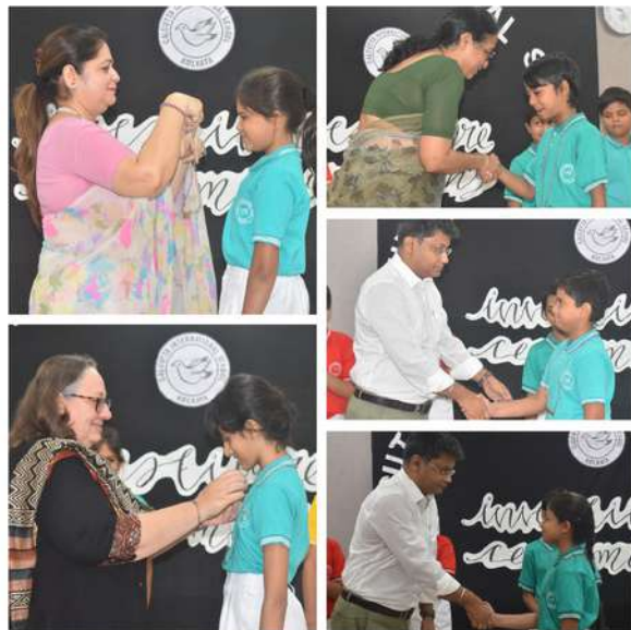
The Green House Student Council Members