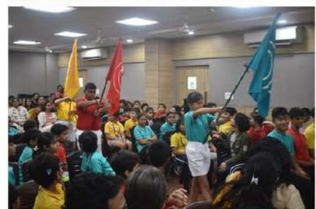
The Emcees of the event with the little musicians and audience