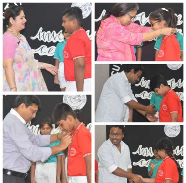
The Red House Student Council Members