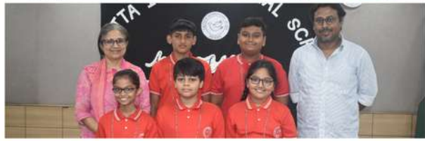
The Junior School Student Council