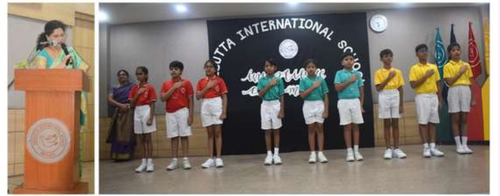
The Oath Taking