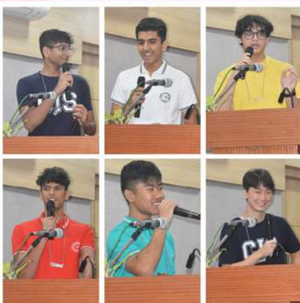
Words of wisdom from the Senior Student Council - Past and Present