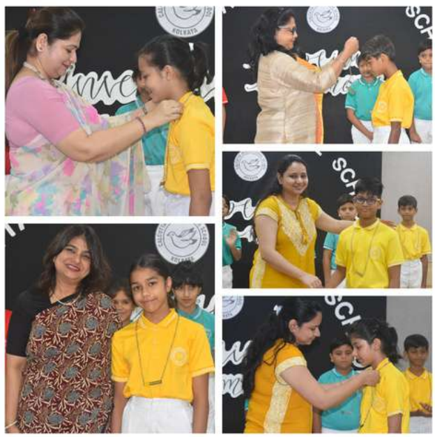
The Yellow House Student Council Members