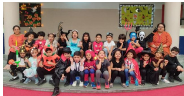
GRADE UPPER NURSERY B