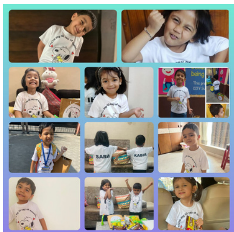
Pre Nursery A

“Children reinvent your world for you.” – Susan Sarandon.