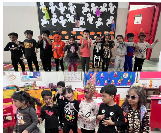
GRADE NURSERY B