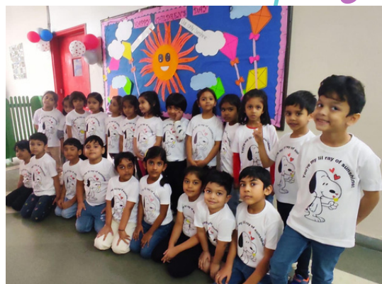
Upper Nursery B