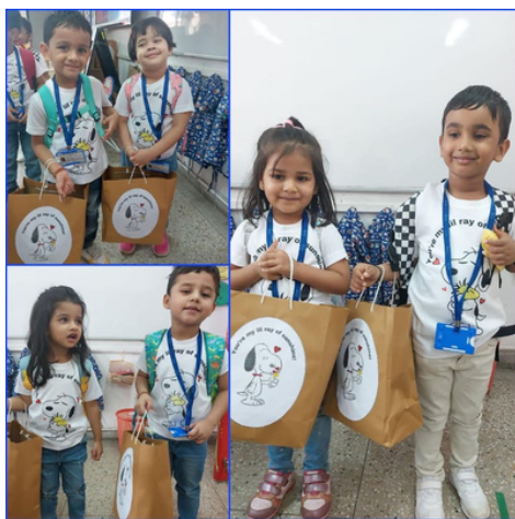
Pre Nursery B