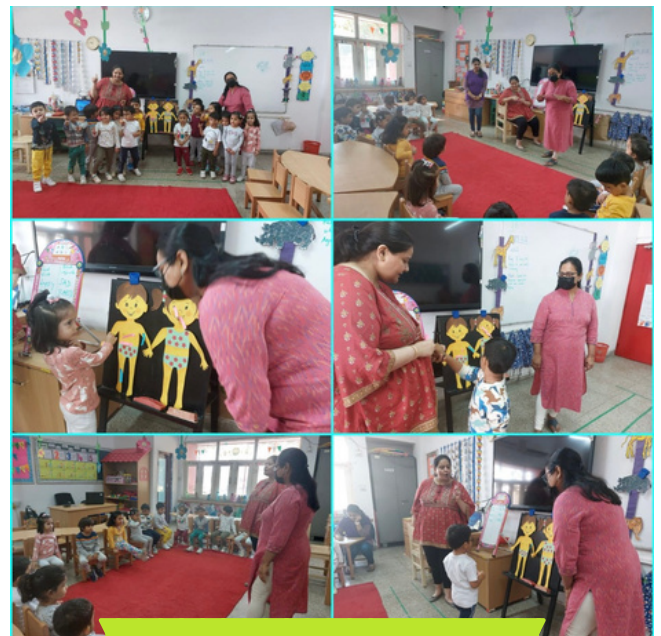
Pre Nursery B