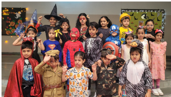
GRADE UPPER NURSERY A