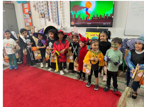
GRADE PRE NURSERY B