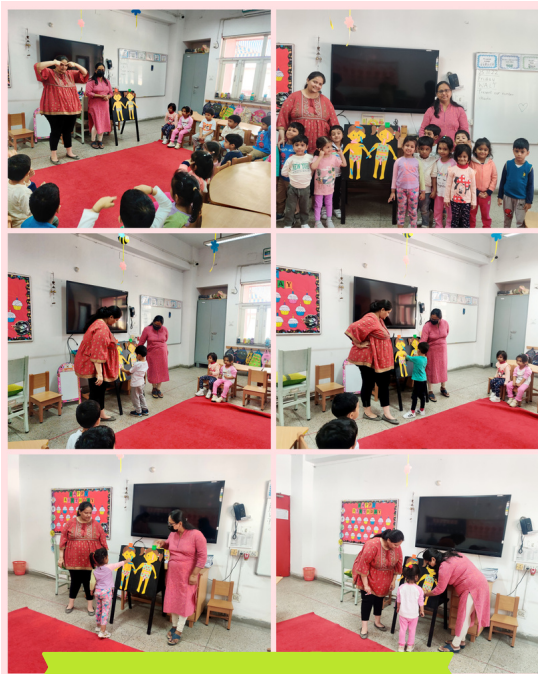
Pre Nursery A