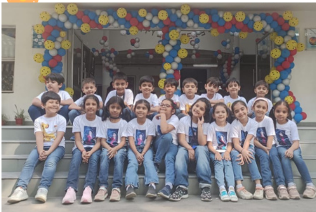
Grade 1 A

This was followed by class photo sessions of students dressed in their new T -shirts.