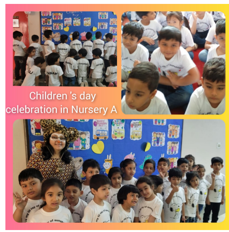
Children's day celebration in Nursery A