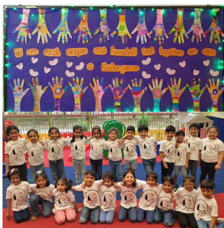
Upper Nursery A