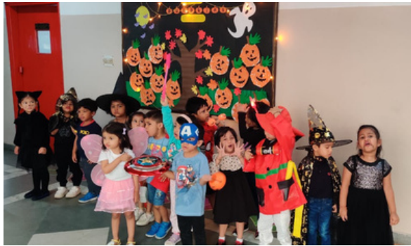
GRADE PRE NURSERY A

Halloween was celebrated on 31st October with a fun-filled and exciting fancy dress parade in the Primary Section. The students of Pre-Nursery, Nursery and Upper Nursery came dressed in various spooky and adorable avatars to mark the welcoming of good spirits and driving away of the bad spirits. The students got the opportunity to go trick or treating, enjoy candies, dance on Halloween songs and appreciate a different culture.