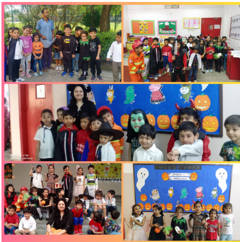
GRADE NURSERY A