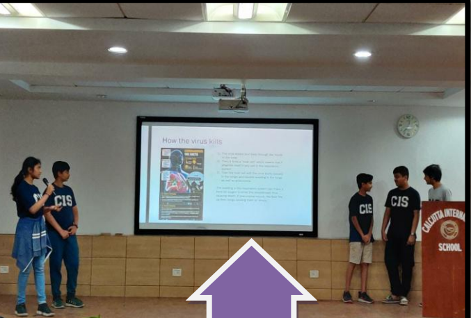
Presentation in the assembly by Grade 9 students: The imminent danger of the Corona Virus and how to be safe from it.