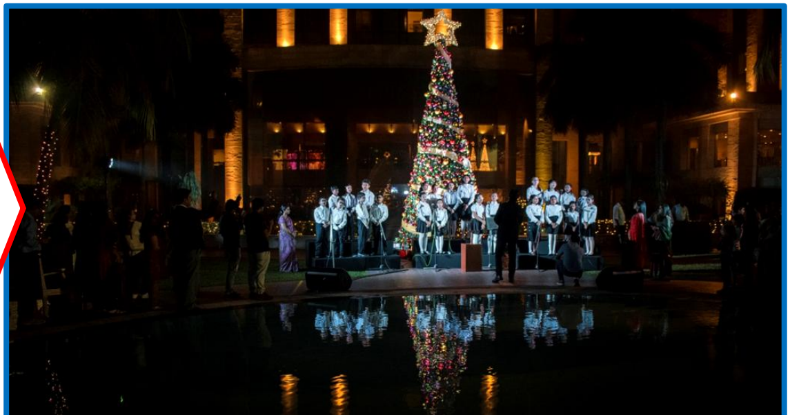
Tree Lighting Ceremony at the Hyatt Regency

We wish the Junior School Choir the very best and may they reach greater heights in future!