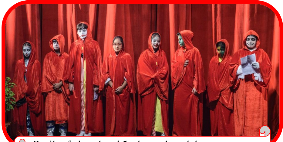
Pupils of class 4 and 5 who anchored the programme