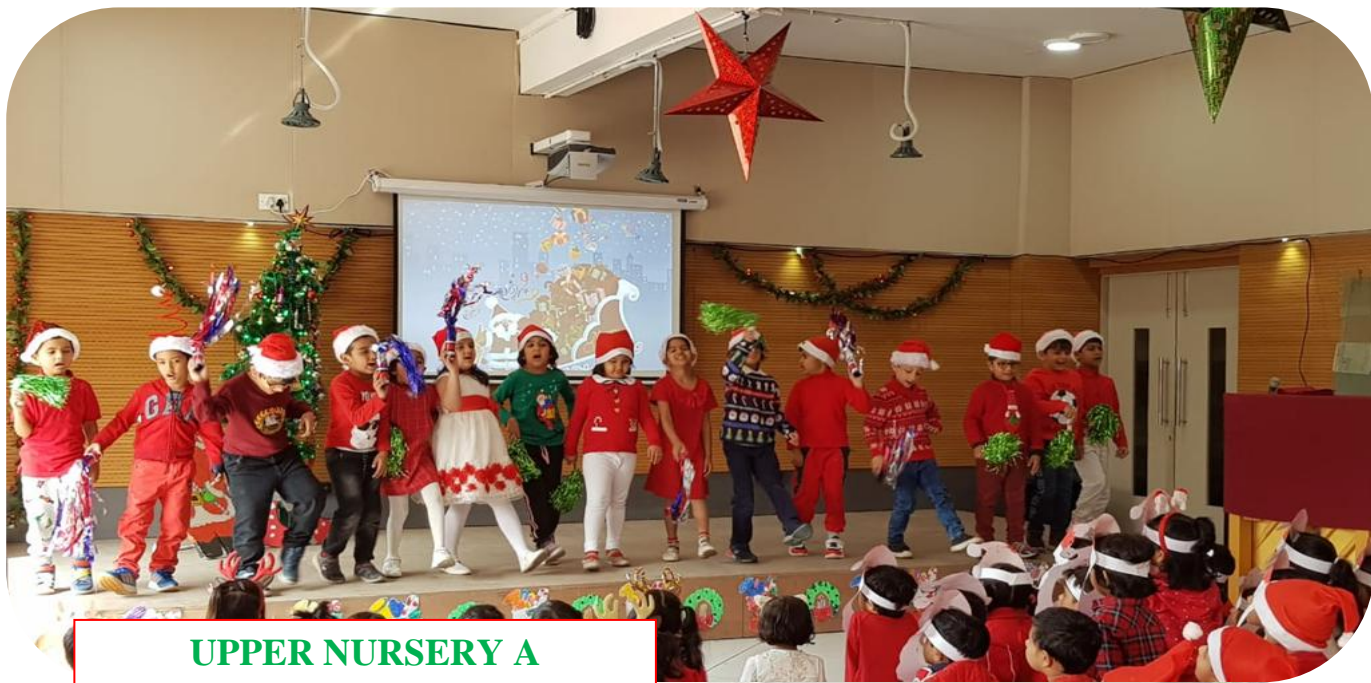
UPPER NURSERY A