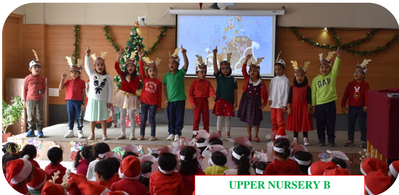
UPPER NURSERY B